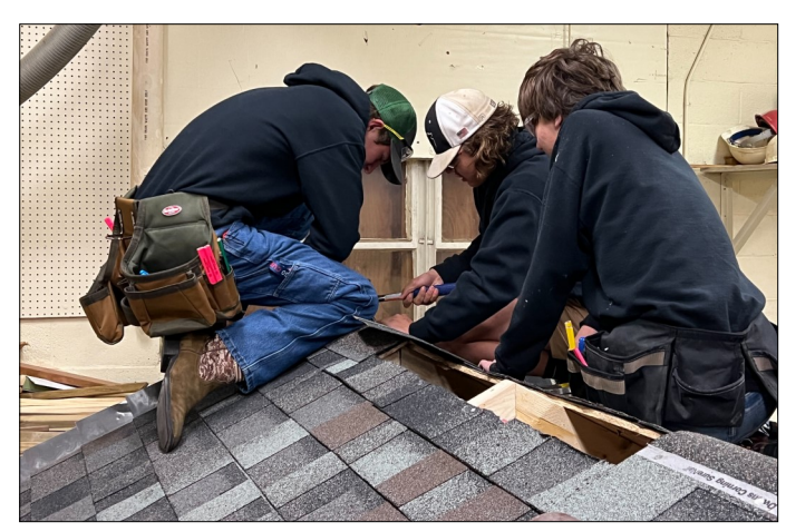
With generous donations from ABC Supply in Freeport, CareerTEC construction trades students learned how to shingle a roof in the fall.

The Career and Technical Education Consortium (CareerTEC) welcomes high school juniors and seniors from Dakota, Durand, Freeport, Orangeville, Pearl City, Pecatonica and Aquin Central Catholic. Eleven of the 16 CareerTEC programs include dual credit from